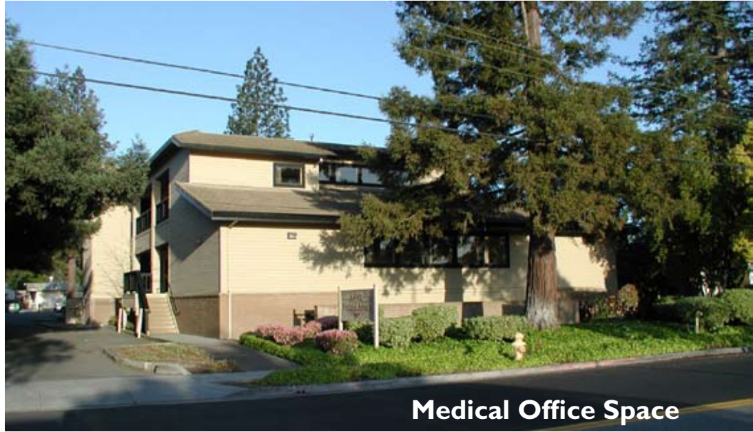
Medical Office Space

Building also is Available for Sale (Call for Package)